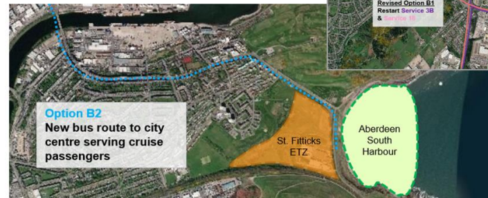
Option B2 New bus route to city centre serving cruise passengers